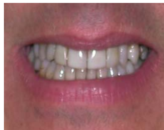
Above is before porcelain veneers and below is after

Ask us if porcelain veneers may be right for you! Your consultation and cosmetic imaging workup are free when you mention this newsletter.