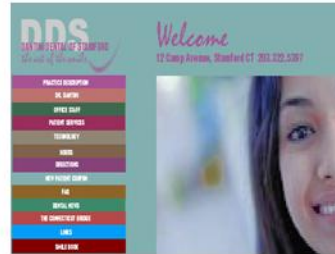
Above is a sample picture from our new website Www.Dentistdds.com